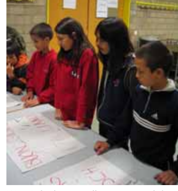
Wow! Such a small country and four official languages: German, French, Italian and Rhaeto-Romanic.

The afternoon contained a funny "Swiss Miniature" - Game, organised by some soldiers. In different locations, the children could learn something about Switzerland. There was a lot to see: For example a big 3-dimensional map of Switzerland where children could touch the mountains on the map.