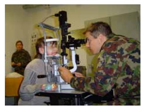
At the eye doctor during the control