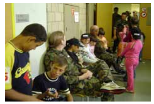
Waiting in front of the medical room..