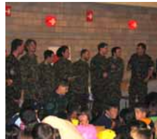
The soldiers are singing swiss hansons. The chant was a big attraction!

The atmosphere was extraordinary and the children went to bed with a lot of happy impressions and surely very tired. Thanks to all the people for organizing this great event!