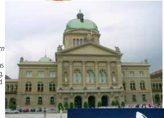
The Bundeshaus in Bern

Bern is the capital of Switzerland. The famous "Bundeshaus" is the government building, home of the parliament of Switzerland.