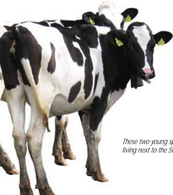
These two young spotted cows are living next to the Swisscor camp.