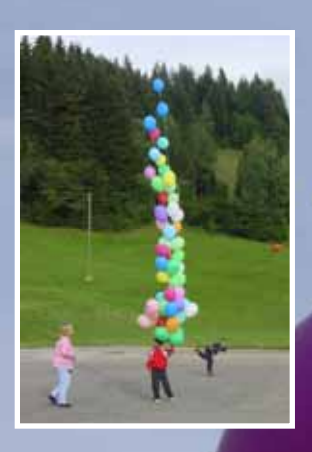
A couple of hundred balloons flew to the heaven.