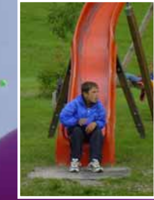
The kids had fun on the playground slide and - as we can see - hey liked the BBQ a lot!