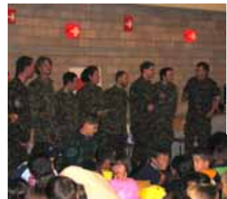
The soldiers are singing swiss hansons. The chant was a big attraction!

The atmosphere was extraordinary and the children went to bed with a lot of happy impressions and surely very tired. Thanks to all the people for organizing this great event!