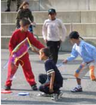
These soap bubbles are really big!

In the evening, all people came together on the place in front of the Kaserne Glaubenberg. A lot of the children were playing with people standing around. Some of them were talking to their guides.