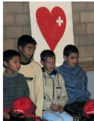
A heart for children