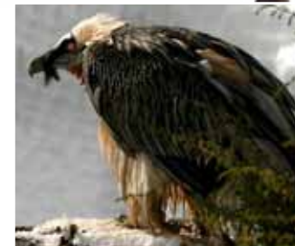
A vulture and a wild pig with babies