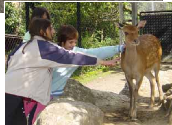
Wow! What a sweet fluffy fur!