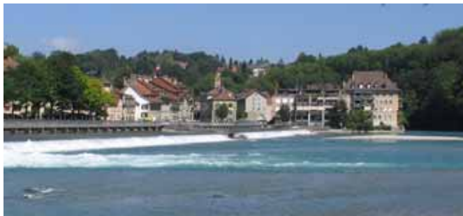
The „Aare“ flows in the middle of Berne.

It was also a great pleasure to the group to meet the minister of defense of Switzerland, Samuel Schmid on the street. Thanks to his agreement the swisscor camp has been made possible.