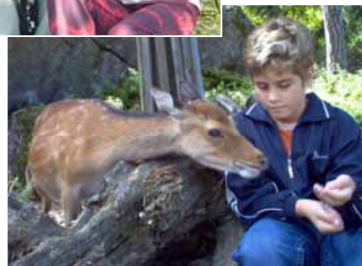
This fawn was very tame and even ate out of the hand