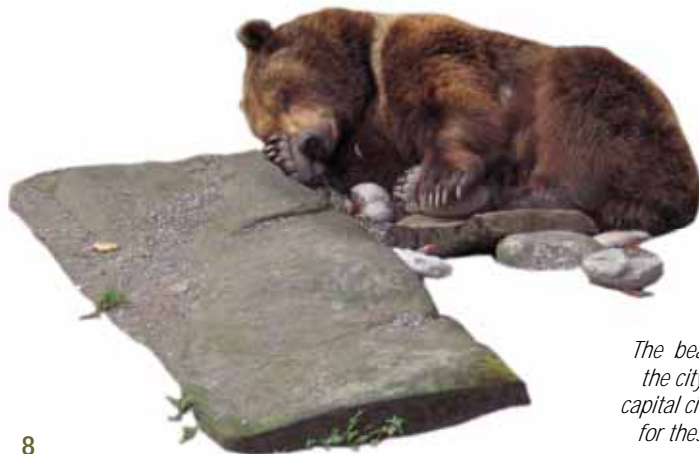
The bear is the symbol of the city of Berne. In the capital city is a special place for these huge animals.

It was also a great pleasure to the group to meet the minister of defense of Switzerland, Samuel Schmid on the street. Thanks to his agreement the swisscor camp has been made possible.