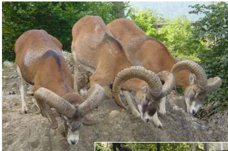
Three rams with their big horns are watching down to the visitors.